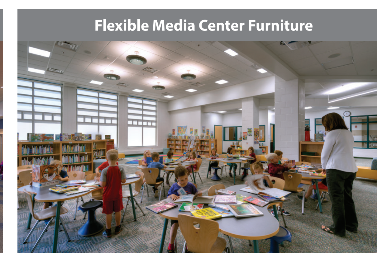
Examples of the types of spaces that could be achieved in Bond 2020